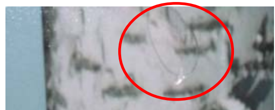
A heavy blow with a hammer left a ding, but did not break the sign.