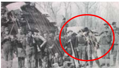
Keys made more visible marks than did sandpaper or razor blades.