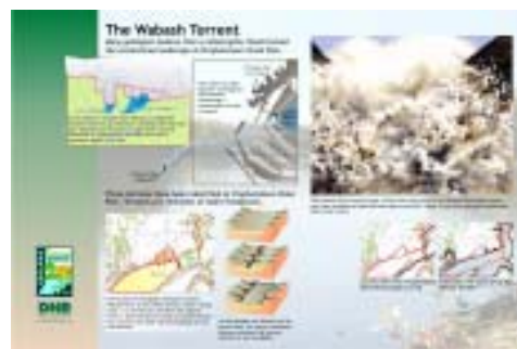
An interpretive theme for Prophetstown State Park is: Glaciers covered the bedrock, altered pre-existing features and created new ones.

This sign covers the dune succession, fragility and protection.