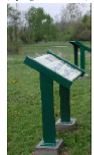
Interpretive Sign City of Hamilton, IN (angled, horizontal)