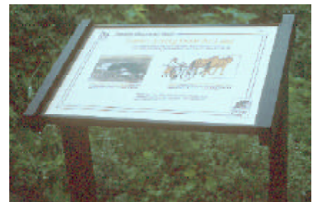
Standard mounting systems cost more than one made in-house, but will add to the lifespan of the sign. (Prairie Duneland Trail signs by Interpretive Ideas)

Will you build the mounting structure in-house, or will you purchase it? Many fabricators provide durable mounting systems for standard sized signs. Such a mounting system (continued on back)